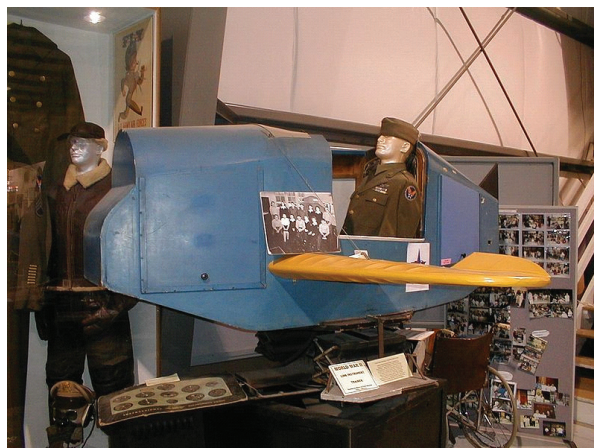
Figure 1. Link Trainer

Mechanical simulations are not just for amusement. Some models have become indispensable job training components. Perhaps one of the best examples were the Link Trainers , also known as the “Blue boxes” or “Pilot Trainers.” This series of flight simulators was produced between the early 1930s and early 1950s by Edwin Albert Link, based on technology he pioneered in 1929 at his family’s business