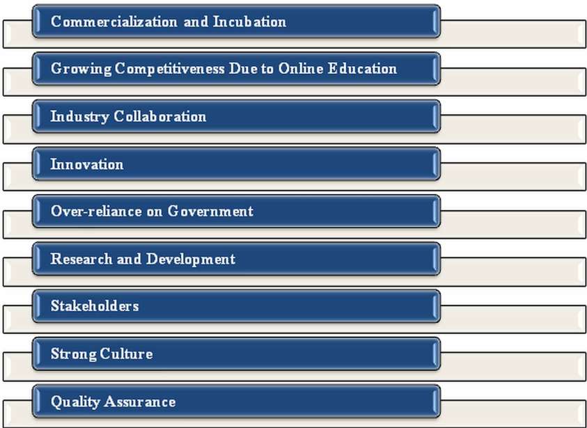
Figure 1. Entrepreneurial University Challenges

to use, and produce or exploit the innovation, many businesses choose to not register a patent as they find it difficult to prove the originality.