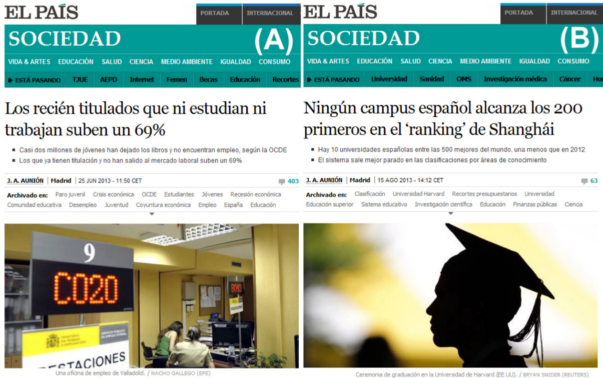
Figure 1. The financial crisis of Southern Europe has made apparent a series of failings in the educational system and in the university structures, which are periodically commented on in the media that make up McLuhan's global village. For example, in A: "Those with a recent degree who neither work nor study rise to 69%" ( www.elpais.es ), and B: "No Spanish campus reaches the 200 first places in the ranking of Shanghai" ( www.elpais.es ).