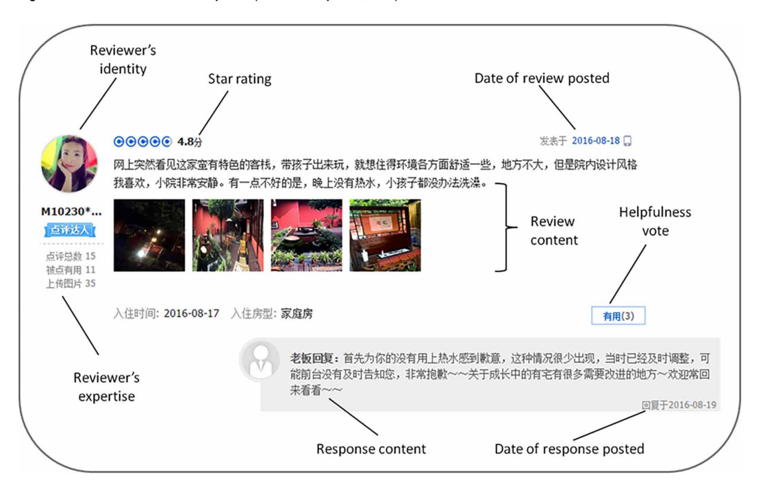
Figure 1. An online review with response

The previous study indicated that hotel's response is more effective for budget hotels than high-end hotels those have defined managerial response strategies (Lui et al., 2018). Thus, we selected 26 budget hotels in the ancient town Pingle in Chengdu as samples and collected 1705 records posted before 1st October 2016 using the LoalaSam v0.3.1 software, among which, 914 reviews are with a response. To furthest ensure that the subsequent visitors (users of the website) have been able to view both review and hotel's response, as well control the influence of response speed, we only employed the reviews which induced hotel's response in 24 hours after they were posted. After filtering out the extreme values, 637 reviews remain for final analysis.