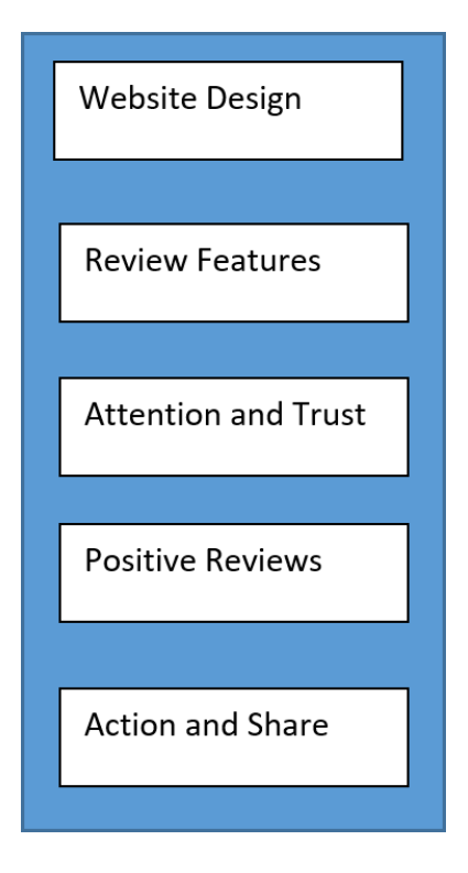
Figure 1. Conceptual framework of the study