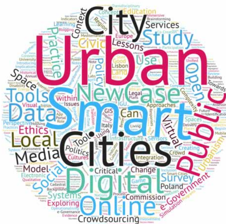
Figure 1. Word cloud based on the titles of all articles published in the IJEPR, 2012-2020 Source: Author own elaboration

The word cloud presented in Figure 1, based on the words that make up the titles of all articles published in the period 2012-2020, provides a suggestive perspective of the issues addressed in the IJEPR until volume 10. A focus on urban issues, on smart cities, on citizens, and on digital technologies applied to urban planning, but also an interest on a myriad of other planning issues, as the constellation of words taken from the titles so well indicates in this figure. In other words, the topics addressed in