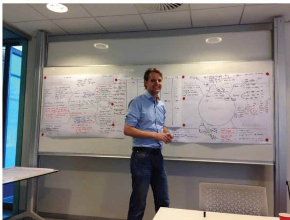
Figure 1. Facilitating a gamestorm session