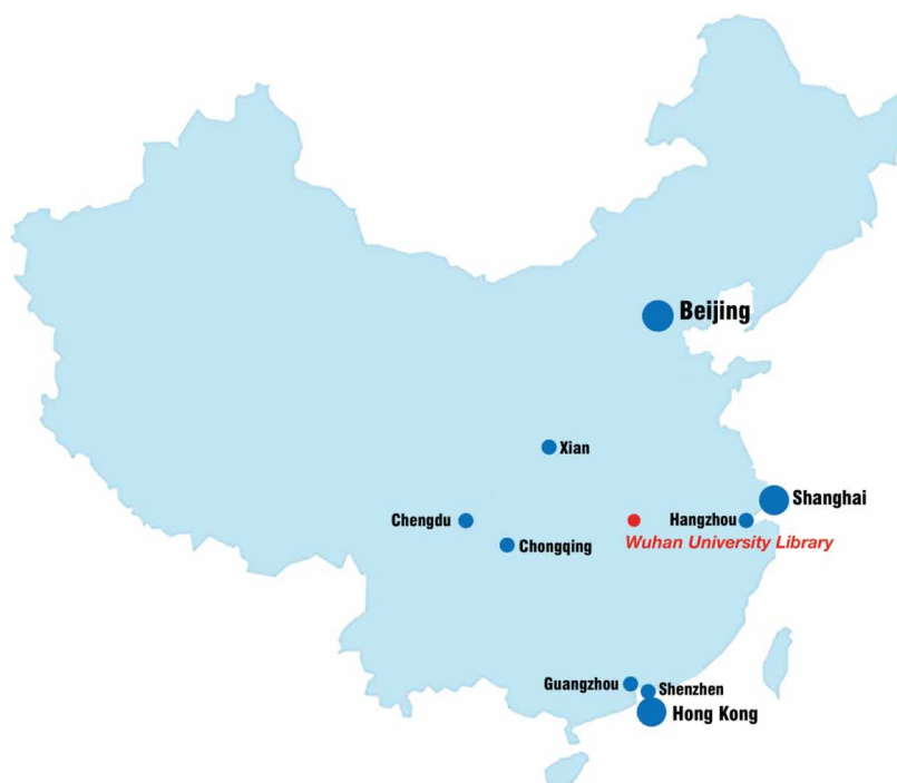
Figure 1. The location of Wuhan University Library

There are some university libraries that did have achieved satisfactory results in cultural services. Wuhan University Library is one of examples in China; it got the title of “National Reading Promotion Base” in 2016 and won the International Marketing Award presented by the International Federation of Library Associations (IFLA) in 2017. The library was founded in 1917. After several expansions, the new central library is located in the center of campus at the foot of Luojia Mountain (a symbol of the university) in Wuhan of Hubei Province (Figure 1). The central library and three branch libraries occupy a total area of 77,389 square meters. Wuhan University Library mainly serves the teachers and students of the university, but people outside can also access the library by registering.