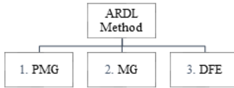
Figure 1. Decomposing the ARDL Method

Where \theta_i = -(\beta_i/\varphi_i) defines the long-run or equilibrium relationship among CoC_{it} and X_{it} . In contrast \lambda_{ij} and \delta_{ij} are short-run coefficients relating growth to its past values and other determinants like X_{it} . Finally, the error-correction coefficient \varphi_i measures the speed of adjustment of CoC_{it} toward its long-run equilibrium following a change in X_{it} . The condition \varphi_i < 0 ensures that a long-run relationship exists. Therefore, a significant and negative value of \varphi_i is treated as evidence of co-integration between CoC_{2it} and X_{it} . Thus, finally, the estimates are measured by: