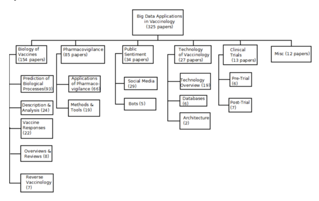
Figure 3. Research themes and sub-themes

themes, the largest of which deals with the prediction of various biological interactions among the various components of antigens and antibodies. Within this sub-theme, the largest thread centers on the prediction of how certain biological entities will interact. Epitopes, sometimes known as antigenic determinants, are the specific place on the antigen that an antibody can attach to in an effort to neutralize the attacker (Khanna & Rana, 2017). Kar et al (2018) describe various methods to identify likely immunogenic amino acid sequences such as artificial neural networks (ANN) and support vector machines (SVM). Rosyda, Adji & Setiawan (2016) use a cascading neural network to predict the epitope region on the P24 protein on the HIV virus. A deep neural network tool is used by Sher, Zhi & Zhang (2017) on a number of standard protein datasets and was shown to achieve substantially better performance than other accepted prediction tools. Additionally, Solihah, Azhari & Musdholifah (2020) couple an oversampling technique with a SVM to develop a conformational epitope prediction model and a method called BPairwise is developed by Zhang & Niu (2010) to predict variable-length epitopes.