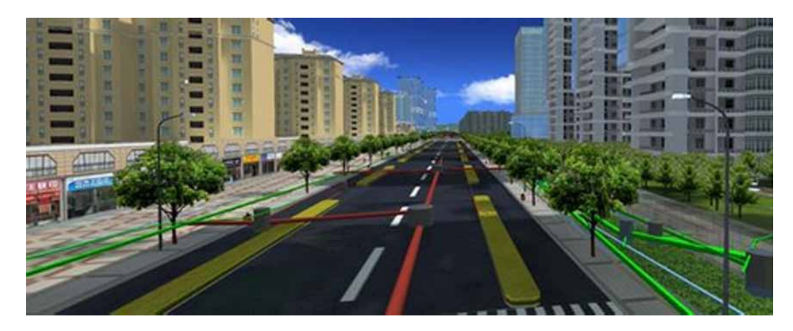
Figure 2. Virtual street scene

The application of virtual reality provides a new way for human to understand the world. First, through virtual reality technology, people can break through the spacetime constraints and experience the past or future events. Second, we can explore the macro or micro world. Third, we can accomplish the things that are difficult to accomplish under the realistic conditions(Hu, 2010).