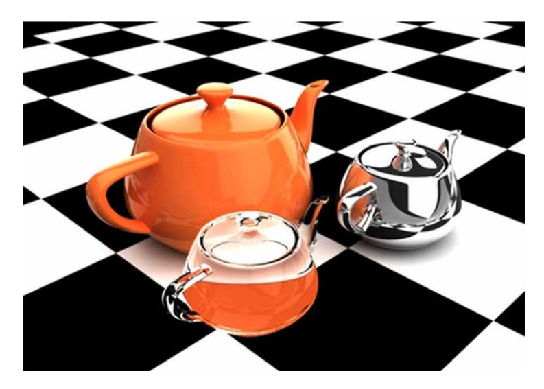
Figure 4. An effect diagram of a transparent object under refraction of light