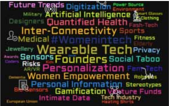
Figure 2. Word Cloud of Top 50 terms