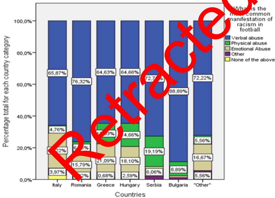
Figure 2. Graphical distribution of the most common manifestation of racism

It can be observed that verbal abuse is believed to be the most frequent type of racism in football (highlighted in blue colour). Speaking about country specific results, we can see that physical abuse seems to have high scores only in the contexts of Greece (12.9%), Hungary (14.7%) and Serbia (19.2%). Additionally, looking at the frequency distribution for the racism type of emotional abuse, we can see that it has scores above 20 percent in the countries of Italy (22.2%) and Greece (21.1%).