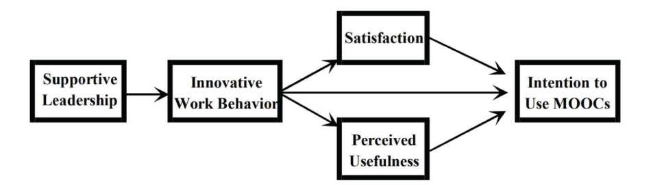
Figure 2. Research model

The sample was drawn from high-ranking public sector comprehensive universities in China. Authors shortlisted numerous Chinese universities listed on the official website of Quacquarelli Symmonds World Rankings, listing 1,397 top universities. There were 71 universities from China, including 43 comprehensive universities (offering almost all major disciplines) in the top 1000 world rankings. The sample included respondents from only the large comprehensive universities because their in-house innovative activities and abilities are more intense; as reported in earlier studies, larger organizations have this advantage over smaller ones (Afsar et al., 2019; Zhao et al., 2020). Researchers reached out to the managerial staff of these 43 universities for liaison and shortlisted 25 universities after confirming they were actively engaged in using MOOCs technology with credit hour courses. Researchers met the management of these universities in person to explain the purpose of this study, and 19 agreed to participate after approval from authorized persons to proceed with data collection.