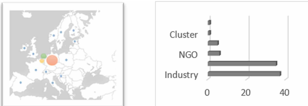
Figure 1. Generalities of the participants of the first Delphi round

Consistent long-term policy goals and supportive policy instruments needed for the transition to a circular bio-based economy are currently missing. For example, there are no legislative mechanisms to support and regulate the use of biomass for producing chemicals and products (e.g., effective demand support policies in favour of bio-based products). The lack of these mechanisms hampers the development of markets dedicated to bio-based products. Moreover, the EC's Renewable Energy Directive (RED) of 2009 and their new proposal for RED II (2021-2030), includes provisions that favour the production of biofuels over bio-based products within Europe. Incentives for biofuel production favour feedstock production for the biofuel industry and limit the availability of biomass