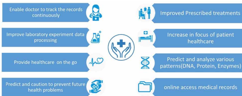
Figure 2. Use cases of Big Data Analytics in Healthcare

These are the brief of the survey papers referred by us to find use case of the big data analytics in healthcare industry. Figure 2 also depict the same to narrate the use cases.