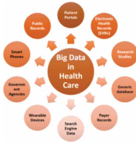
Figure 1. Insight of Big Data in healthcare