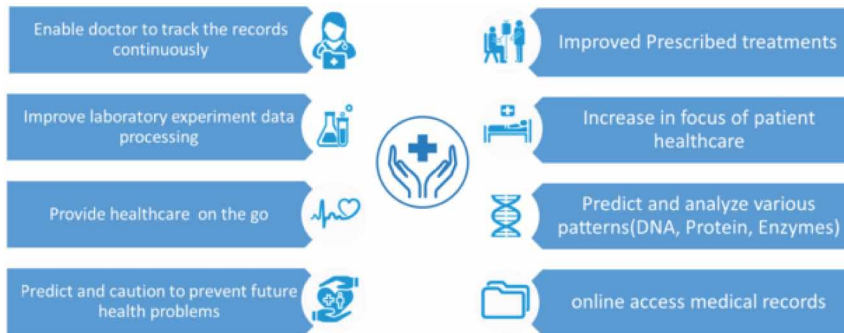
Figure 2. Use cases of Big Data Analytics in healthcare