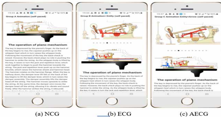
Figure 2. Sample screenshots of the experimental conditions

operation. In the hammer subsystem, each component was sequentially signaled with red arrows alongside the cued component during the time course of the animation. In the damper subsystem, each component was sequentially signaled with blue arrows alongside the cued component as the animation progressed. Each set of red-blue arrow cues appeared in the animated segment for five seconds and did not vanish until the next set of red-blue arrow cues appeared. Although the arrow cues were transitory, the entity cues were present in each component throughout the animation. The incremental and successive manner in which the entity cues were presented resembled snowballing cueing (e.g., A, A + B, A + B + C, etc.) by incrementally connecting each component one by one until eventually associating all of the components in a complete set. The arrow cues appeared successively but vanished after five seconds. The entity cues appeared incrementally but did not vanish until the end of each phase (Fig. 2c).