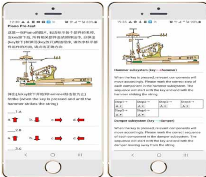
Figure 4. Sample screenshots of the prior knowledge tests

A prior knowledge test (Cronbach’s alpha=0.850) was administered to determine the learners’ background knowledge concerning the piano mechanism. Twenty-two multiple-choice items were in the direction test and nine items were in the order test (Fig. 4).